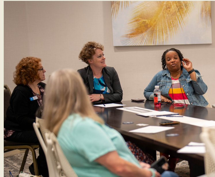
38 FLORIDA LIBRARIES