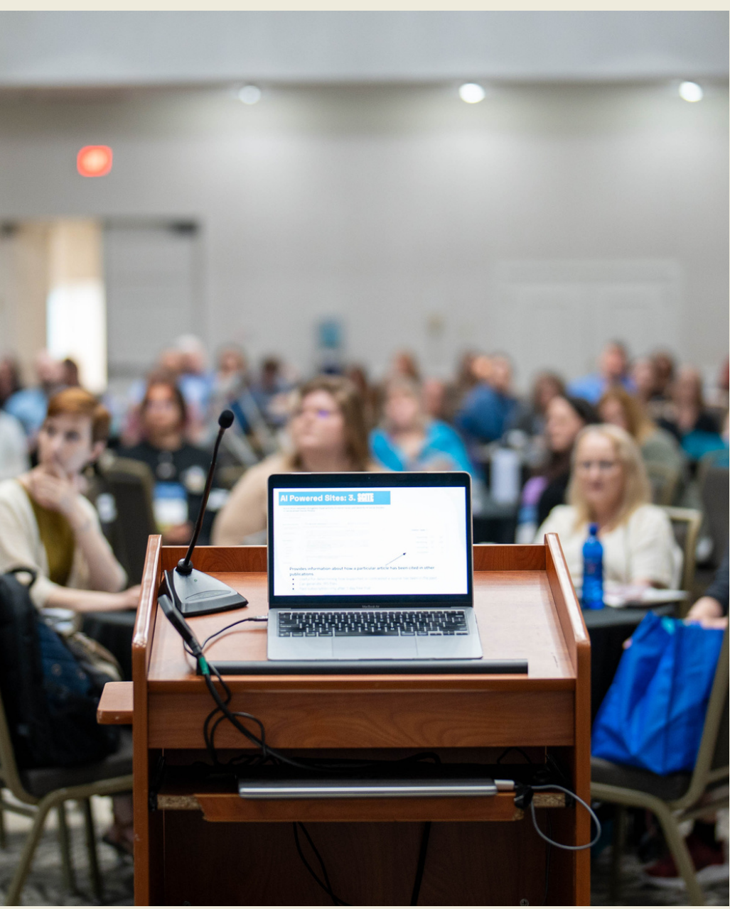
28 FLORIDA LIBRARIES